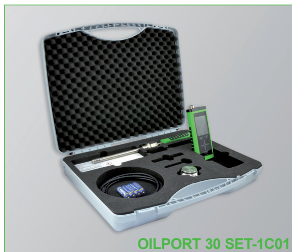
OILPORT 30 SET-1C01

The optional calibration kit is used for easy 1 and 2 point adjustment of the a_w reading.